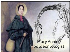
Mary Anning palaeontologist