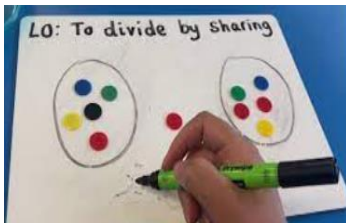
LO: To divide by sharing