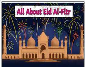
All About Eid Al-Fitr